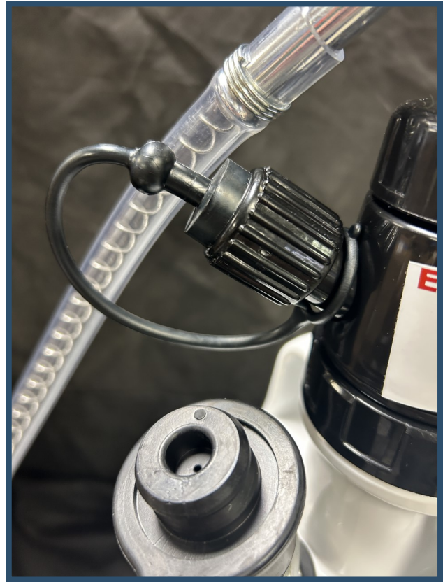
Dust Plug - DP BP1165, $5.50

Protective Coverings are available for a wide variety of couplers and other fittings as well. Let us know what you need?