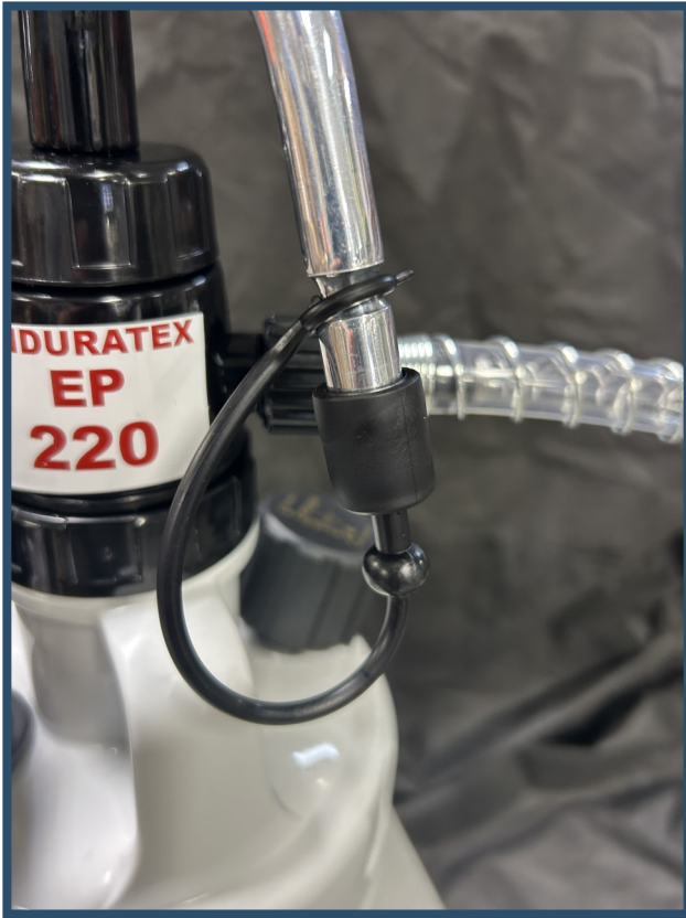
Dust Cap - DC BP077S, $5.50

Dust Caps and Plugs help to avoid contamination from airborne particles and dirty equipment. It is important to wipe clean all components before using plugs and caps.